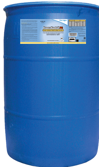
95% Food Grade Propylene Glycol

In all these applications, it is necessary to add a heat transfer solution to the water to achieve the desired operating temperature. In addition, the heat transfer solution should contain a corrosion inhibitor to protect system metal as closed systems are invariably troubled with corrosion in the absence of an inhibitor. Inhibited glycols, ethylene or propylene are typically the compounds used in applications for HVAC/R system freeze/burst protection, process heating/cooling, refrigeration coil defrosting, cold room dehumidifying, sprinkler systems and etc.