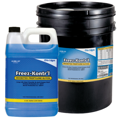
70% Propylene Glycol