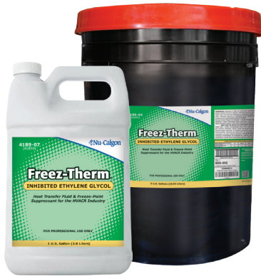
96% Ethylene Glycol