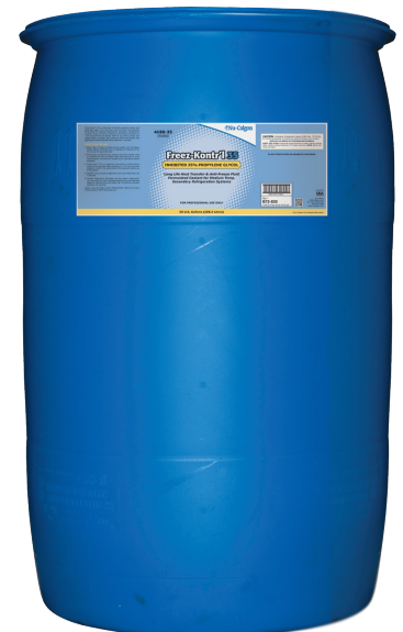
35% Propylene Glycol for Secondary Cooling Systems