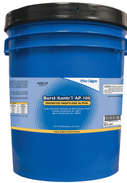
For Aluminum Heat Exchangers