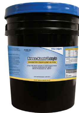
95% Propylene Glycol